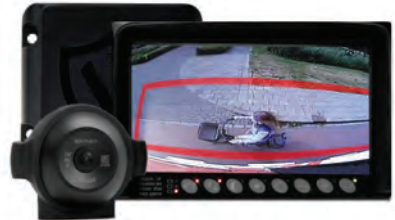
SideEye Blind Spot Detection